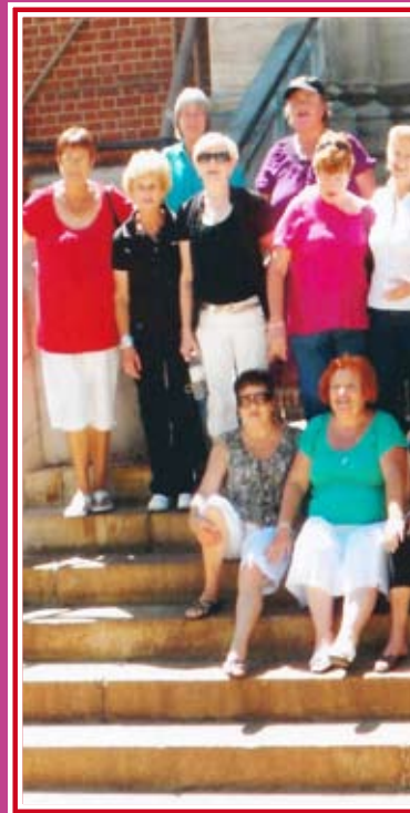
A good time was had by all on the 19 th March this year. The girls were invited to lunch at the Perth Cenotaph for the Forgotten Australians' memorial.