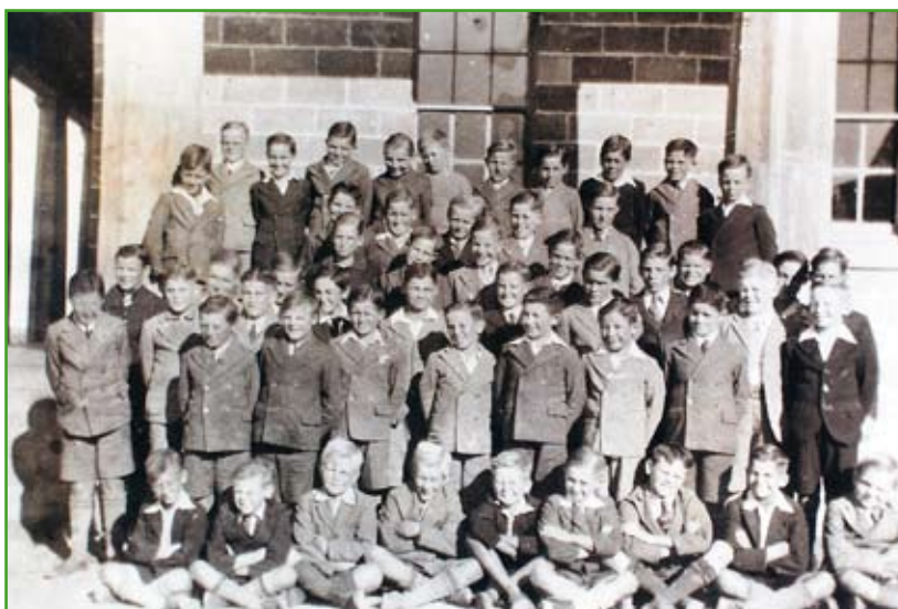
Group of migrant boys arriving at Tardun Farm School

made to sign an agreement with the Government of Malta that they will not influence or remove the migrants from the control of the Christian Brothers in WA.