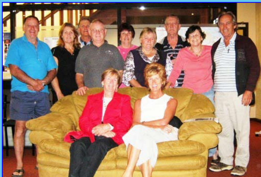
Photo published with the kind permission of group members

CBERS Redress Service is funded by the Department for Communities to provide individual counselling and support groups to Redress applicants.