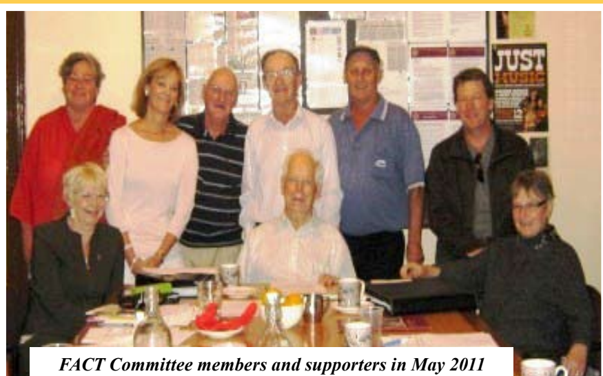
FACT Committee members and supporters in May 2011

If you would like to make a donation to FACT, or a bequest in your Will, please post your donation to FACT Inc., 24 High Street, Fremantle 6160. All donations and bequests will be publicly acknowledged by FACT Inc. and reported in the newsletter, so please advise us if you do not wish your donation to be acknowledged in this way.