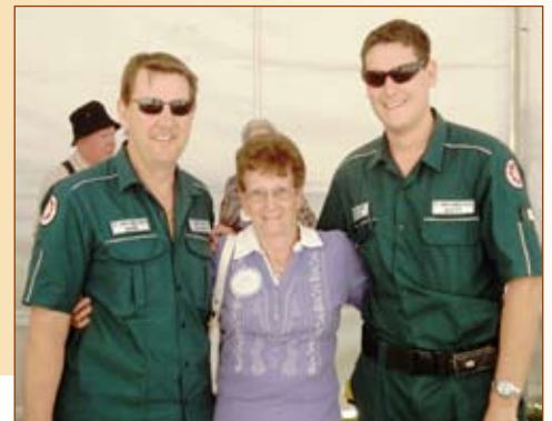
At the unveiling of the Forgotten Australians memorial

The words on the Forgotten Australians memorial plaque pay tribute to yesterday's care leavers and also emphasise the lessons to be learned about caring for children now and in the future: